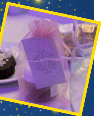
TABLE GIFT SPONSOR - Delight 450+ attendees with a special gift just for them, placed at their individual place settings. Your logo will be placed on the gift, included on the event website, and on social media.

SHOPPING BAG SPONSOR - Your logo will appear on the coveted shopping bag gifted to all attendees. Soon, your branded tote will be paraded all over town.