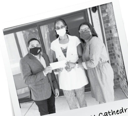
Thank you, Victory Cathedral!

We're thankful for our friends from Nicor, who spent a day sprucing up a Bridge campus, laying down mulch and beautifying the gardens! Thank you for increasing the curb appeal at the campus.