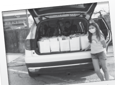
Thank you, Westgate Girl Scouts!