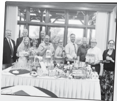
Thank you, Carol Stream Rotary Club!

Many thanks to our friends from Victory Cathedral for your generous $1,000 donation to help support the families served by Bridge Communities!