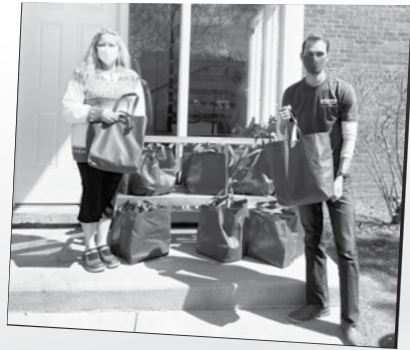
Thank you, Perma-Seal!

Thank you to the Perma-Seal team for donating 90 kitchen essentials bags to Bridge Communities! Each bag contained sponges, dish towels, garbage bags, aluminum foil and more—all the little things needed in a kitchen. The bags were much appreciated!