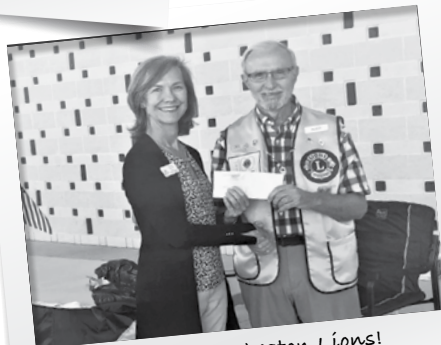
Thank you, Wheaton Lions!

We are grateful for the Wheaton Lions Club! They generously awarded Bridge Communities a $2,000 grant to help support our nutrition program. Thank you!